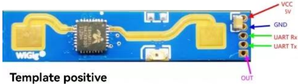
Figure 1 Module pin definition diagram